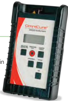
Optional Accessory: OmniCure R2000 Radiometer

Radiometry is an essential link for measuring the light output from a UV curing system in order to maintain a repeatable process. The OmniCure R2000 UV Radiometer can be combined with the OmniCure S1500 UV curing system to provide a complete curing station with unmatched control and repeatability.